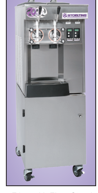
F144 with Floor Stand